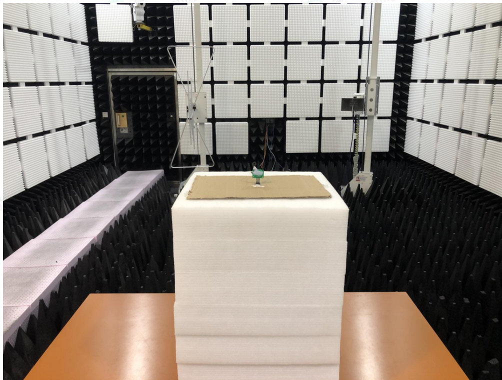
Spurious Emission below 1GHz & above 1GHz